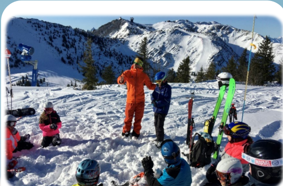
Safety trainings for secondary schools