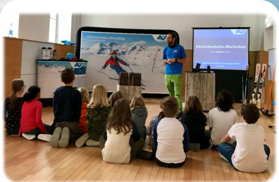
Workshops for elementary schools