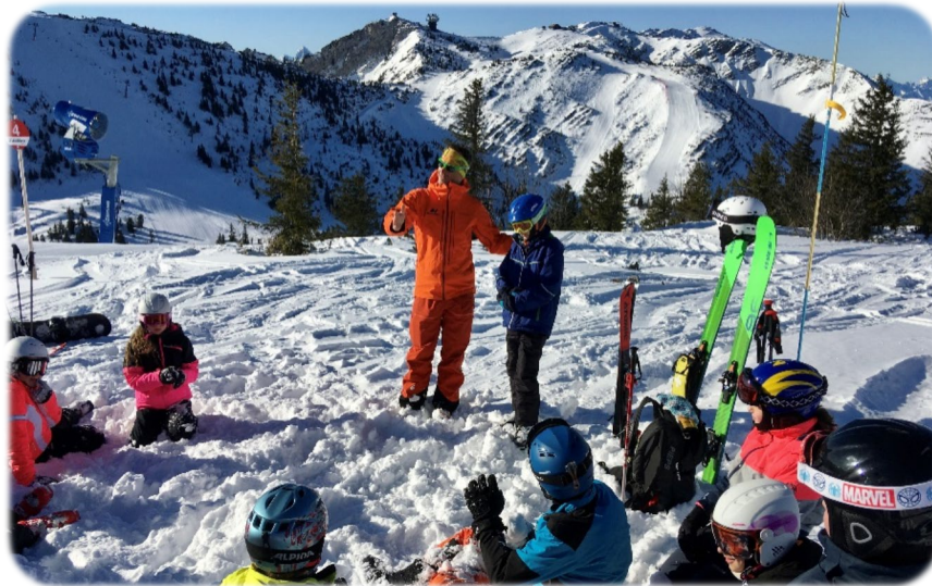
Safety trainings for secondary schools