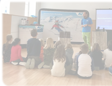
Workshops for elementary schools